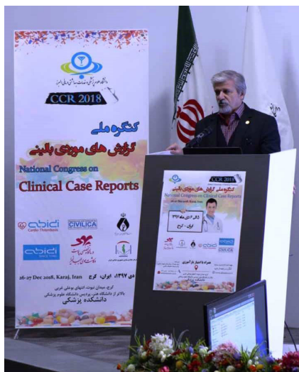
Figure 2. Vice Chancellor for Research and President of the Congress.