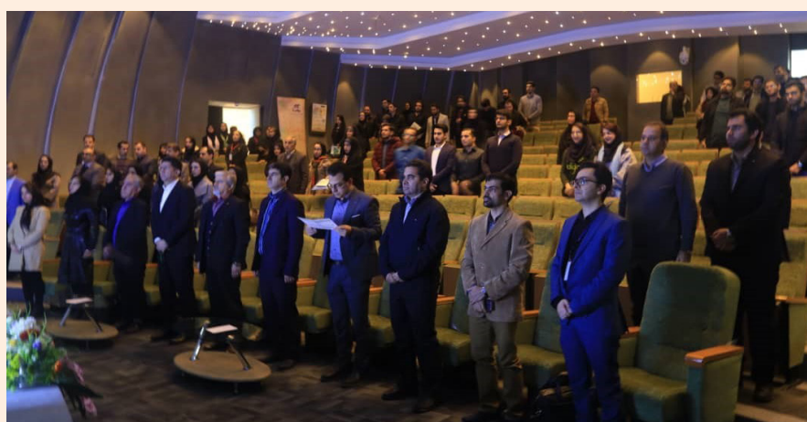
Figure 3. The Opening Ceremony of the Congress.